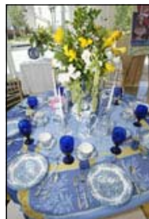
"A Taste of Provence" table from A Blooming Affaire 2004