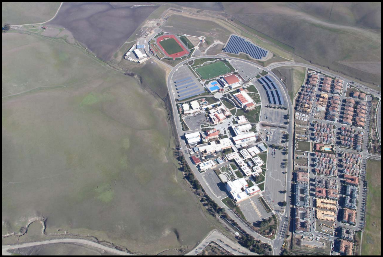
After Measure B Bond Las Positas College - Year of 2013