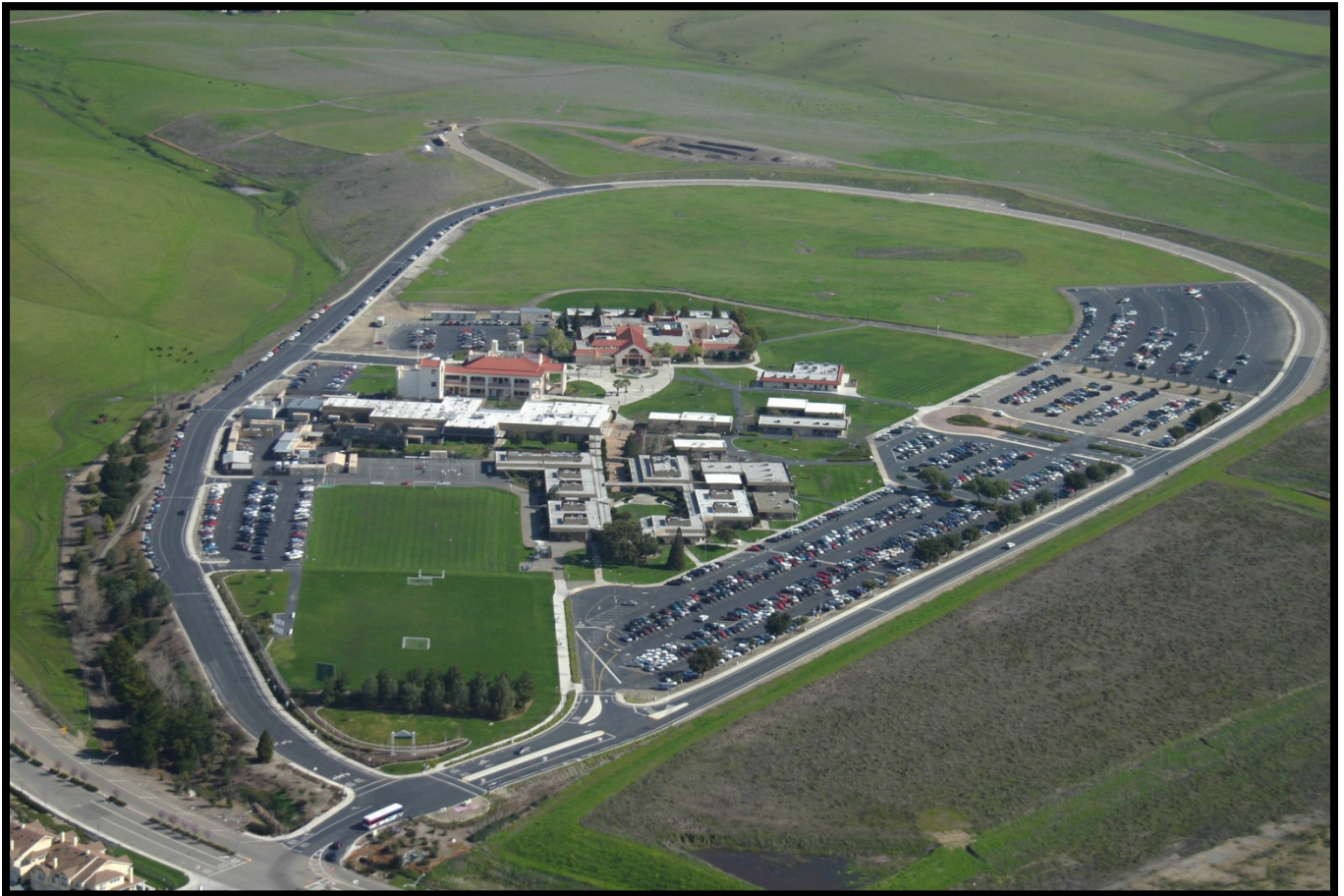
Before Measure B Bond Las Positas College - Year of 2004