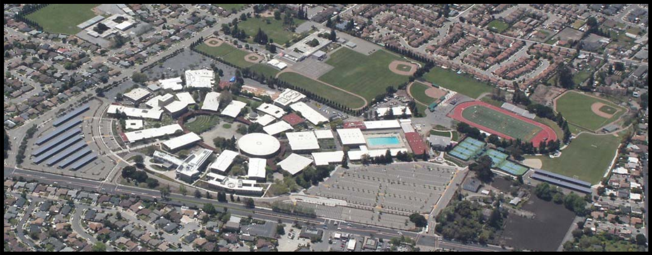
After Measure B Bond Chabot College - Year of 2013