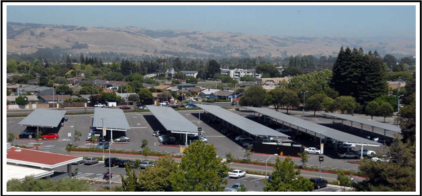
Lot G with Photovoltaic