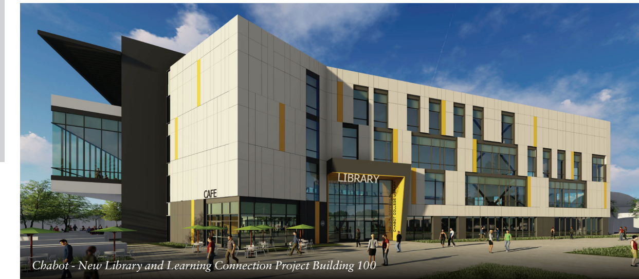
Chabot - New Library and Learning Connection Project Building 100

The Measure A funding has provided the District the opportunity to upgrade technology throughout both campuses and bring connectivity to every corner of the campuses in the first year of the program. Moving forward we have envisioned new and renovated facilities at the Chabot College campus to improve our facilities and address student needs across all disciplines. Las Positas College will see growth of existing programs and expansion of the campus to provide better access to facilities to all students including veterans, those with disabilities, and pursuit of career pathways. Each campus will begin the program with construction of student support space and expansion of learning resource facilities to align with the District's "Vision for Success" goals.