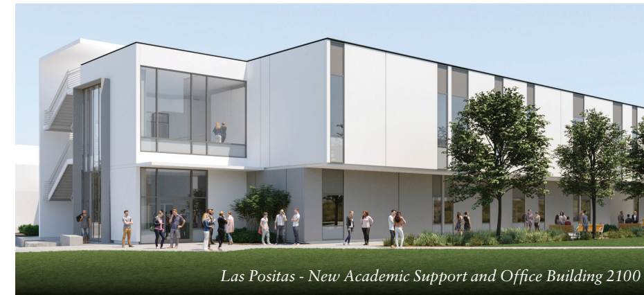
Las Positas - New Academic Support and Office Building 2100

The New Viticulture Facility will replace the existing facilities currently located inside and outside of Building 800. The Viticulture Facility will be located at the main entrance off the Campus Hill Road. This new roadway will connect the new facilities into the existing campus. The new facility will be developed at a higher elevation allowing for expansive views. The project will include general site grading and utility infrastructure; new roadway and pedestrian pathways connecting to the existing campus. There will also be a visitors center with a tasting room, visitor parking and clear paths of travel. The Winemaking Facility will include classrooms, labs, office, and resource areas, crush pad, equipment storage, cold storage, and an outdoor patio.