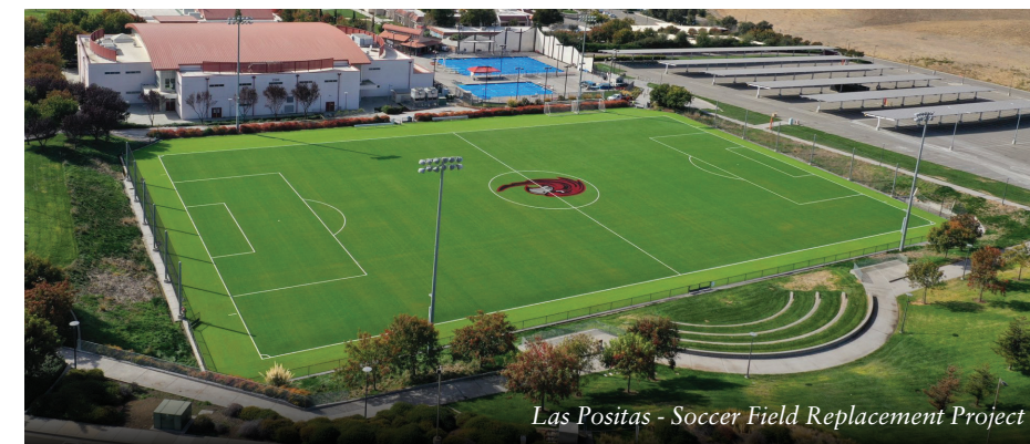
Las Positas - Soccer Field Replacement Project