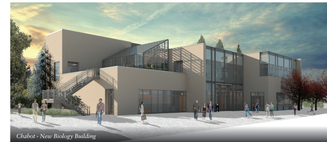
Chabot - New Biology Building