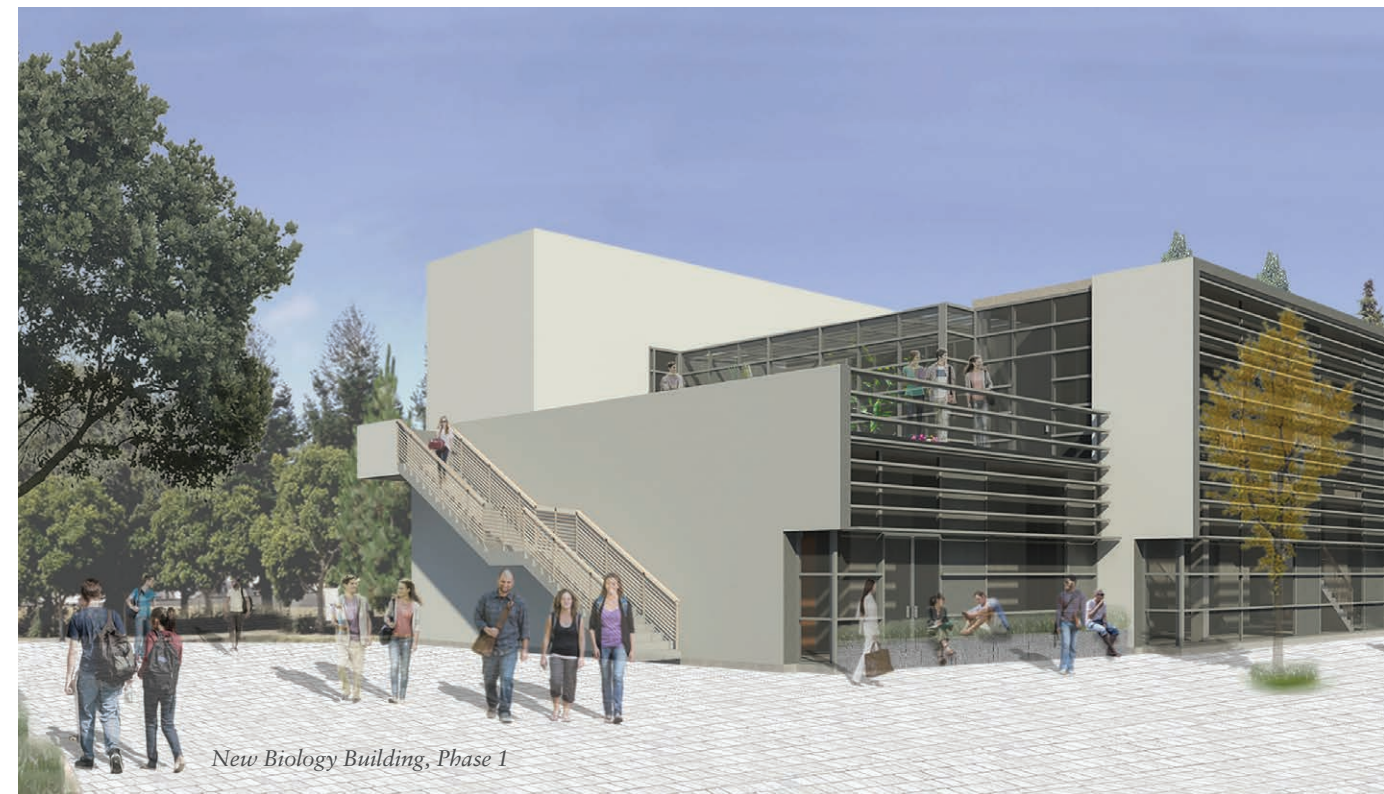
New Biology Building, Phase 1