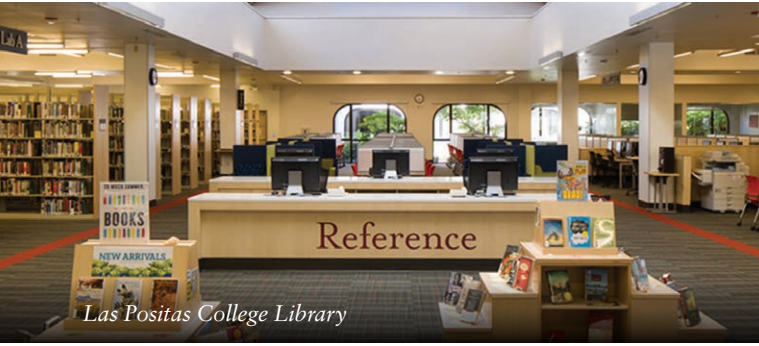
Las Positas College Library