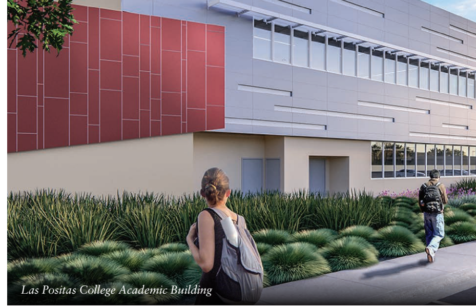
Las Positas College Academic Building