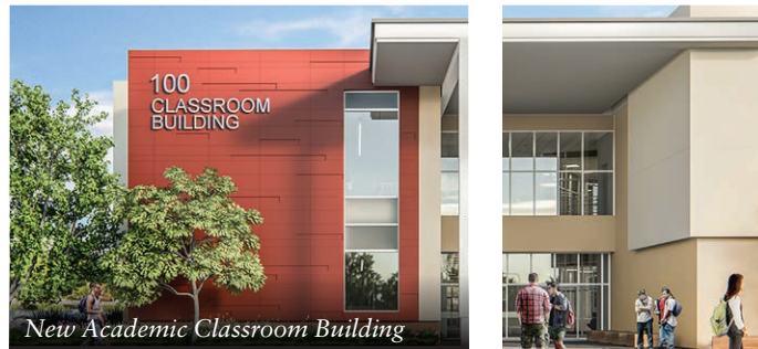
New Academic Classroom Building